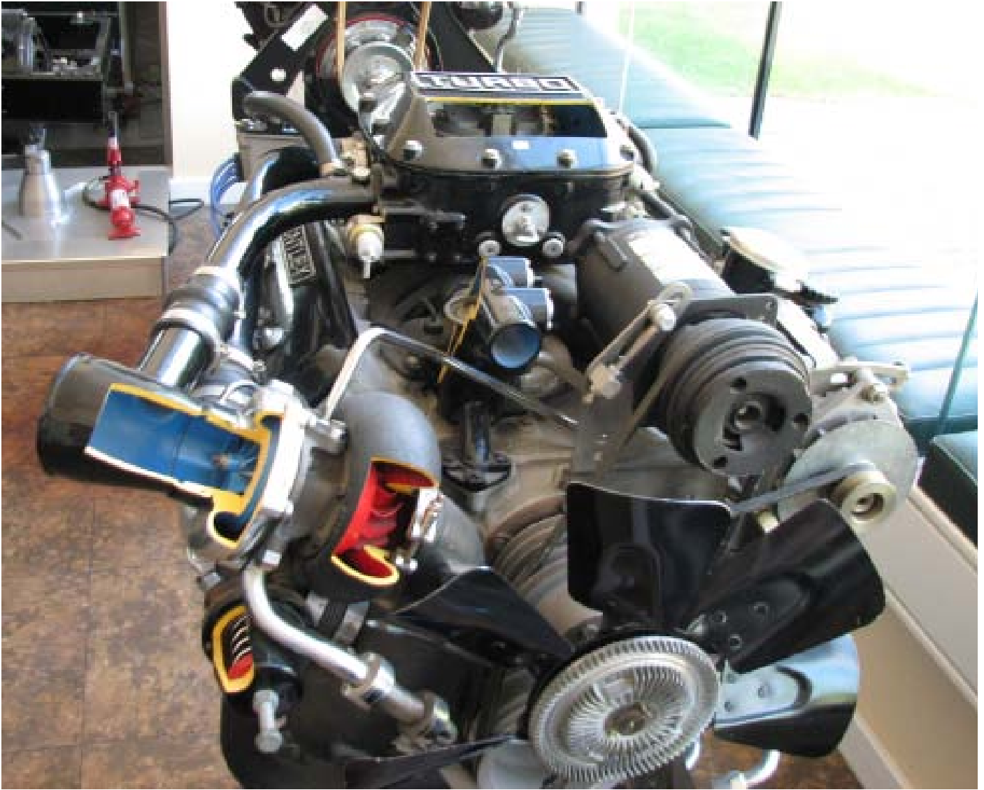
Above: Another engine exhibited is this early Mulsanne Turbo 6.750 c.c. V8.