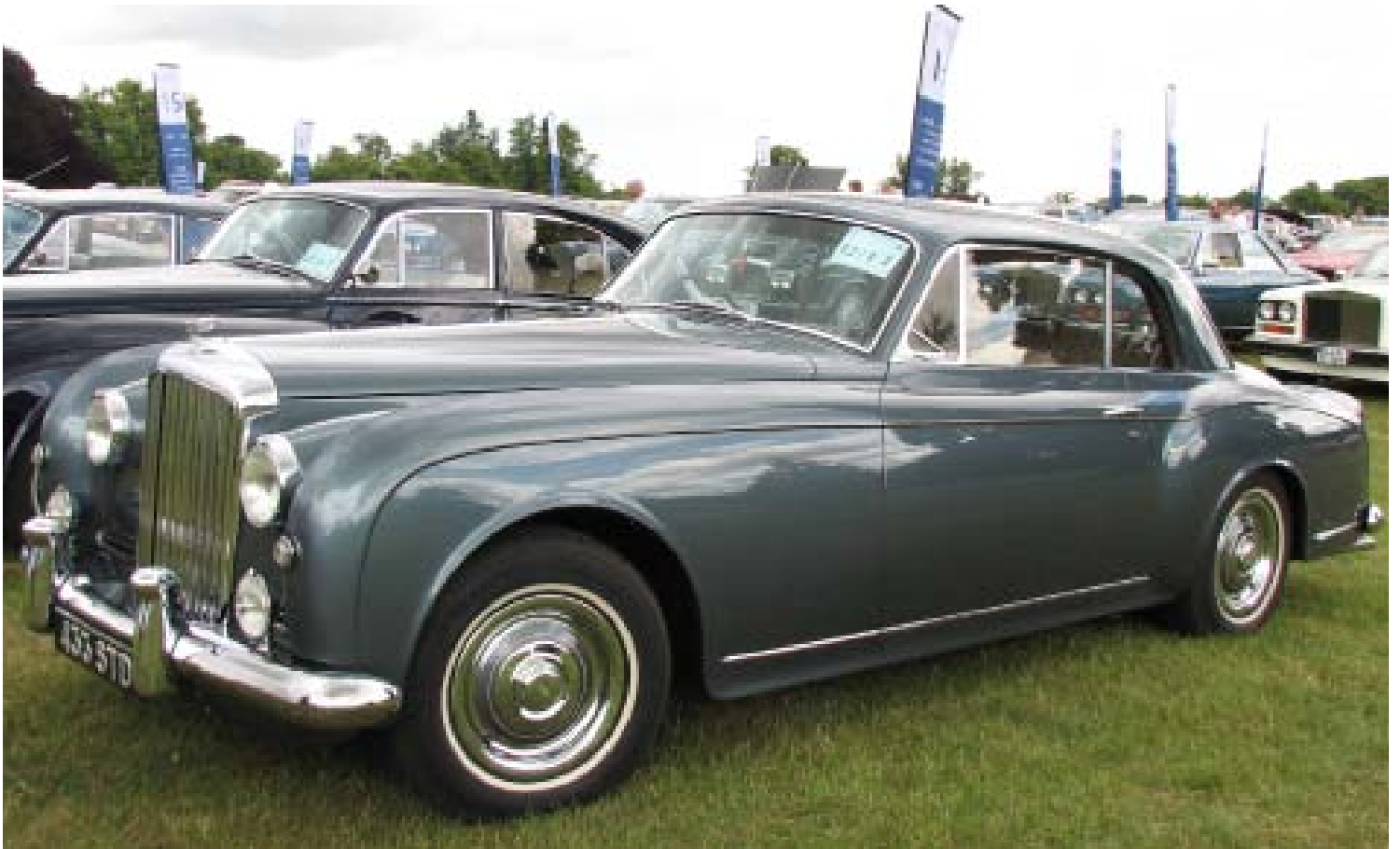
Later Bentley Continentals included (above) this 1956 S1, BC44BG, with Park Ward coachwork and (below) a 1963 S3, BC100XA, with rare two-door coachwork by H.J. Mulliner.