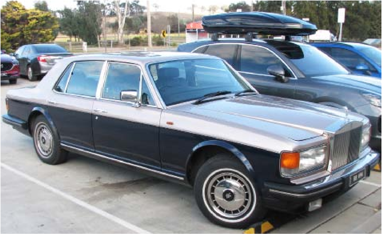
Above: The Presidential Silver Spirit III, ASR54357.