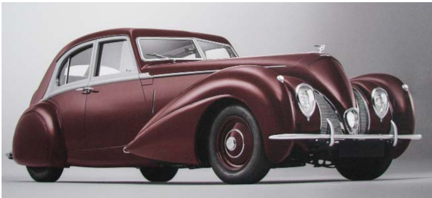
Above: One of the displays in the B.D.C. Headquarters features the pre-war Experimental Bentley 'Corniche', which was a more sporting version of the Mk V model which was never introduced to the public due to the intervention of World War 2. The Company at Crewe has built a credible re-creation for display at its Heritage Centre.