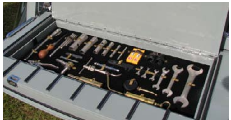
Below: This 1938 Wraith James Young saloon WMB53 is in superb condition. Right: Its toolkit stowed in the boot-lid is none too shabby, either!