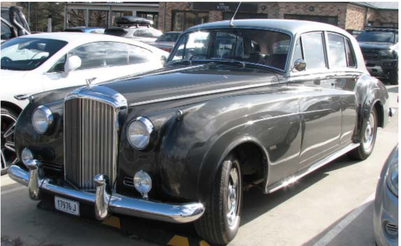
Below: Your Editor's 1960 Bentley S2, B25CT.