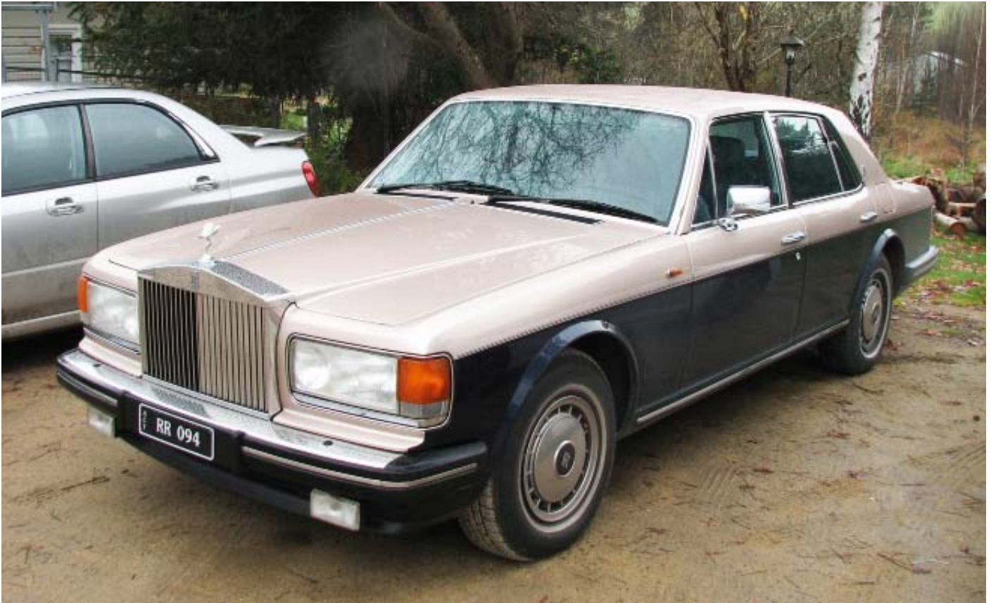
Above: Our President's 1994 Silver Spirit III ASR54357 arrived with a healthy car-load of family members.