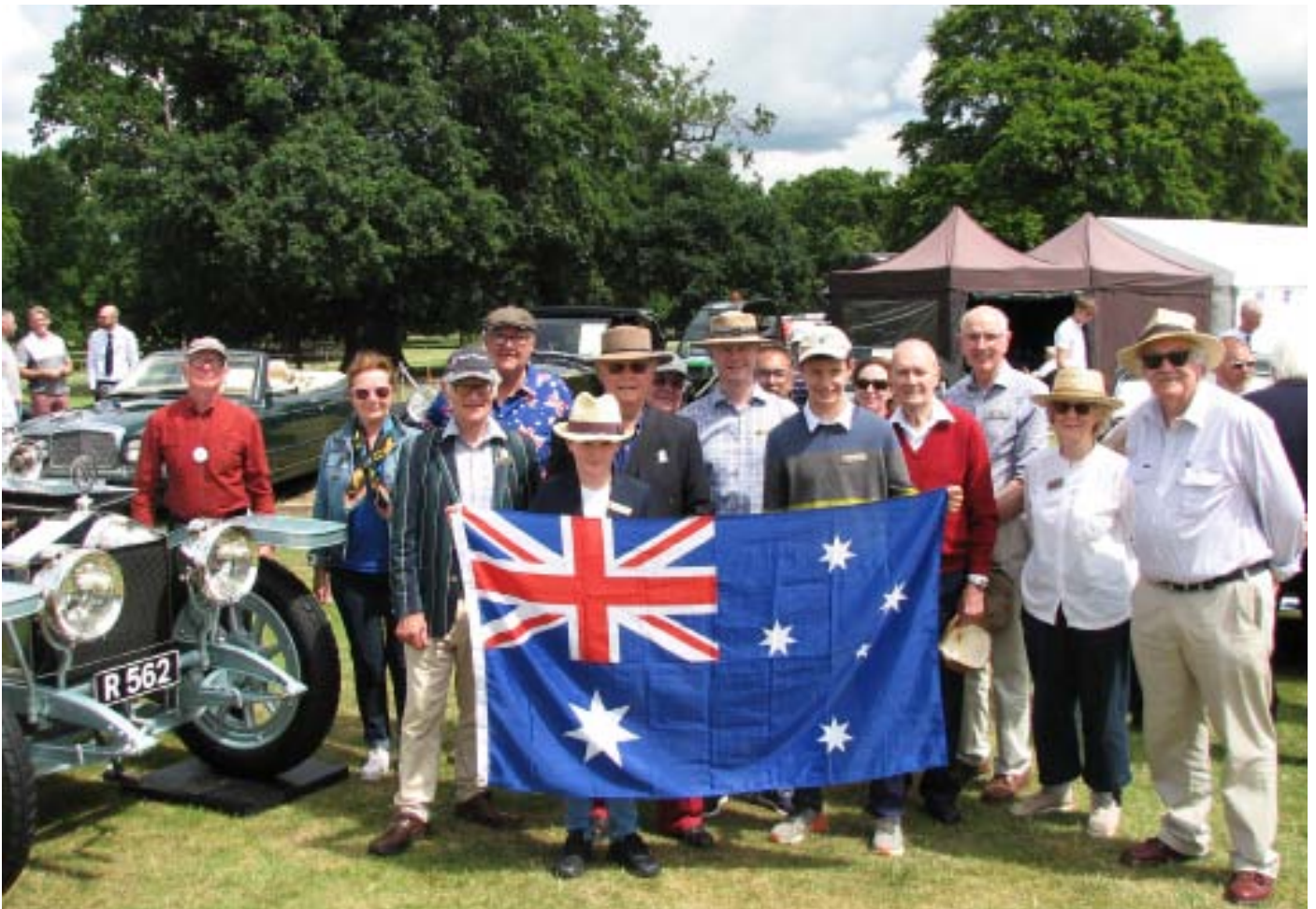
Below: The Australian group this year was understandably a little smaller than usual. Your Editor is on the right of the photo.