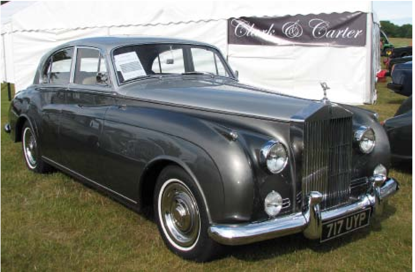
Above: This Silver Cloud I has superlative coachwork by James Young. When new it would have cost at least 40% more than a standard saloon.