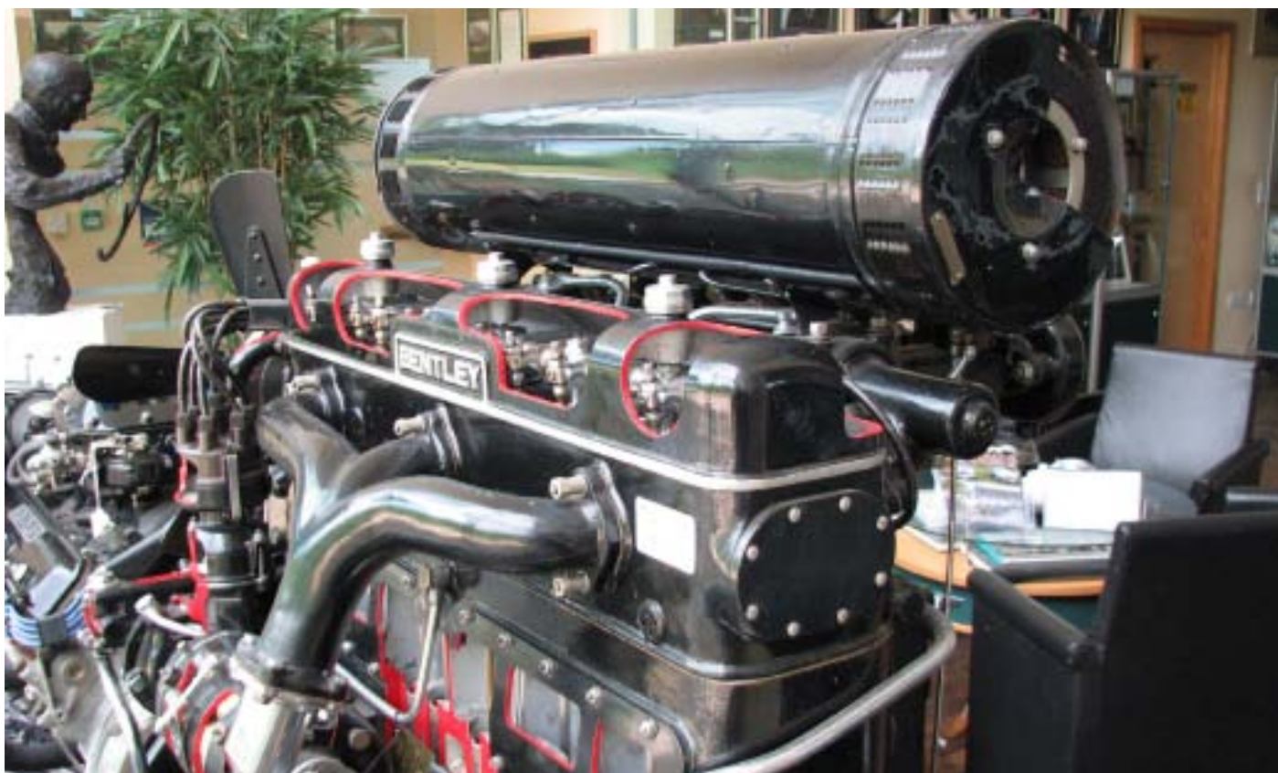
Below: This pre-war (Derby) Bentley engine, sectioned for display purposes, is one of several Bentley engines exhibited at Wroxton.