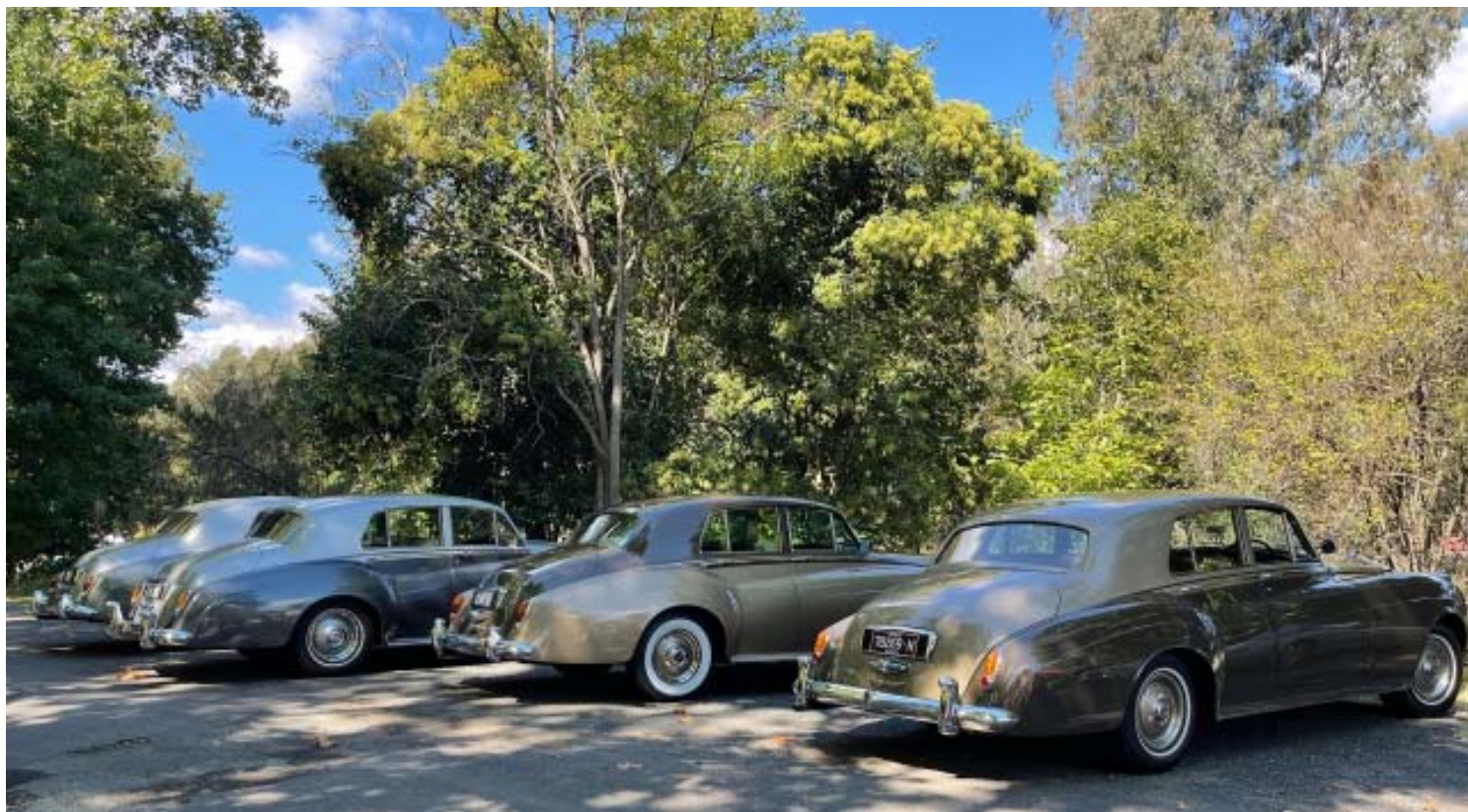
Very shapely Silver Cloud and Bentley S Series tails during a lunch stop at Jingellic, N.S.W. during the 'Head in the Clouds' Register run in April which attracted considerable A.C.T. Branch participation.