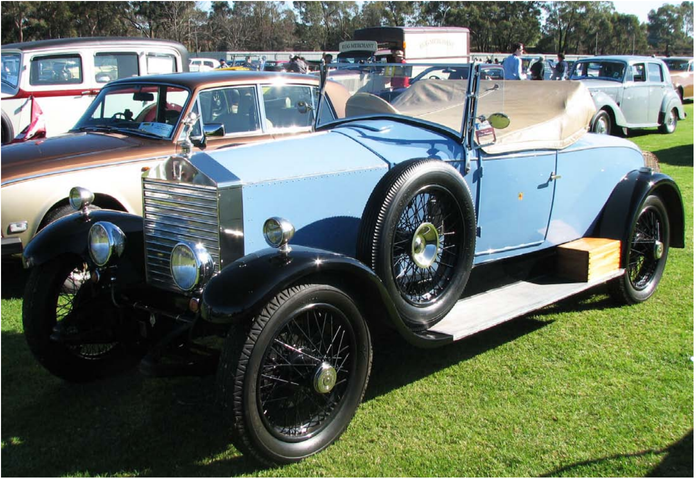
Above: Said to have been a recent local 'find', this Twenty Horsepower roadster was photographed on the Concours day but could not be identified using the Rally Handbook.